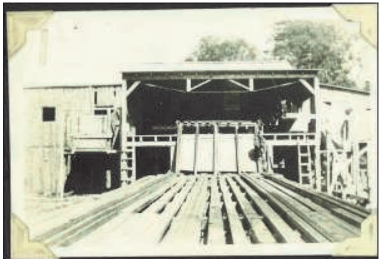
The Canadian Sawmill

The Canadian Forestry Corps stuck to a formula for their sawmills. Each was equipped with a 100 horsepower diesel engine to power all of the machinery. It was an impressive line of machinery too - with headsaws, resaws and edgers. Once the timber was sawn into boards, a light railway was used to take them over a timber bridge to trucks waiting at Inverey. The road from Inverey to Braemar was straightened out with bulldozers to make the trip easier. From Ballater the journey continued by rail to Aberdeen harbour. The bridge the Canadians built over the River Dee was intended as a temporary structure. However it survived until the 1960s when floods undermined its foundations, and its subsequent removal proved to be rather tricky as it had been so well constructed.