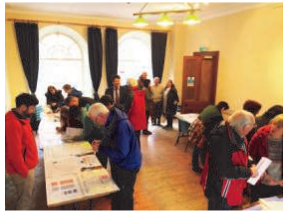
Open Day March 30th Castleton Hall

If you were unable to attend, comments continue to be most welcome and you can make these through a link at www.invercauld.estate/BraemarSustainable/index.html . Please do let us know your thoughts. We shall also be holding future events in due course as the masterplan develops as feedback from the wider community will be essential to making it a success. Developing the masterplan will take a significant amount of time and resources to complete as it is an evolutionary endeavour. Whatever the masterplan eventually looks like, it will also take a lot longer to implement. However, the incredibly special environment of Braemar, with its rich history and enterprising people gives us a huge amount of confidence in the prospects for the village to enjoy a very special - and sustainable - future.